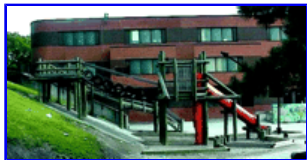
Fig. 1: An unsafe (above) and a safe (right) playground. In the unsafe playground, the height a child may fall from equipment is greater than 1.5 m, the surface under the structure is bare earth and the surface on the hillside is concrete, even though it is an area where a child might fall. The equipment at this playground was removed and replaced.

View larger version (77K): [in this window] [in a new window]