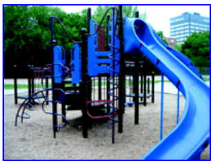
Figure 1. Continued.

View larger version (77K): [in this window] [in a new window]